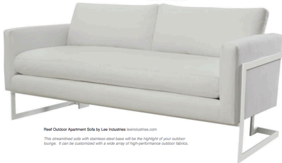
Reef Outdoor Apartment Sofa by Lee Industries leeindustries.com

Outdoor lighting is essential for ambiance and evening entertaining. Update and streamline your outdoor lighting with this timeless aged iron wall lantern.