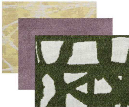
Holly Hunt Great Outdoors Fabric Collection: Ocean Floor/Luminous, Beach Blanket/Sea Urchin and Ecriture/Verde hollyhunt.com

I love the simple silhouette of this concrete dining table. Pair it with upholstered chairs for comfortable yet sophisticated al fresco dining.