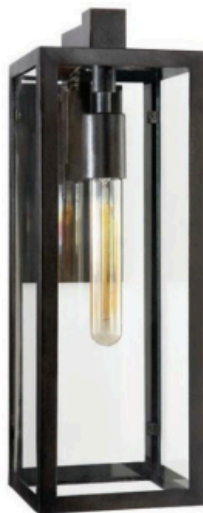
Fresno Framed Sconce by Visual Comfort visualcomfort.com

Today's solution-dyed synthetics are softer and more luxurious than earlier polyester versions. These all-weather, colorfast fabrics will add a soothing but fun pop of color to any outdoor space. Better yet, bring these fabrics indoors for kid and pet-friendly upholstery or stain-resistant dining chairs.