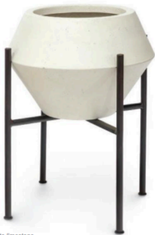
Nova Planter by Palecek palecek.com

At Keri McKay Interiors, we welcome spring with open arms. It's a time to refresh our interiors, and of course, unveil and renew our outdoor living spaces. When furnishing an outdoor area, I suggest choosing pieces with clean, simple lines and soothing muted colors that complement their natural surroundings; allow nature to take the spotlight. I use area rugs, lighting and accessories for a layered look and always select materials that will weather gracefully.